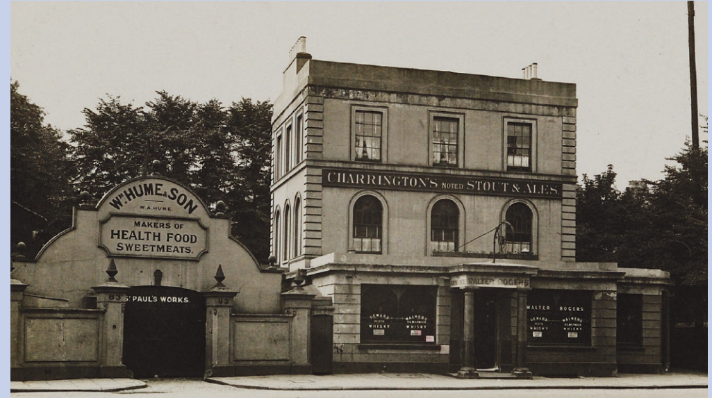
Above: The Alwyne Castle in 1919

LONDON LOCAL PUBS – PAST AND PRESENT | 11